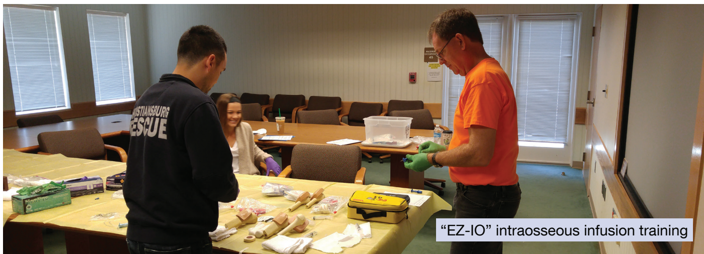
“EZ-IO” intraosseous infusion training

Provided Information Technology Support for all 11 regional EMS councils by employing an IT support specialist and contracting various other services.