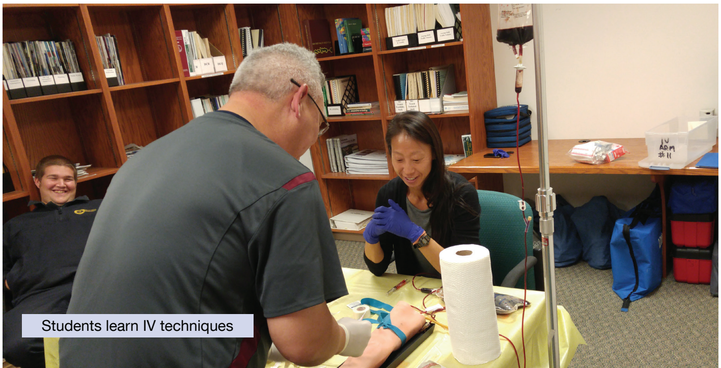
Students learn IV techniques