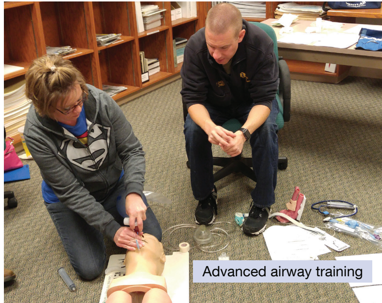
Advanced airway training

Offered ADLS and BDLS courses in conjunction with NSPA.